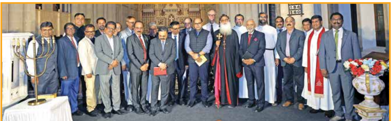
Dignitaries at the Sesquicentennial Inaugural Function

For and on behalf of the Board of Bombay YMCA