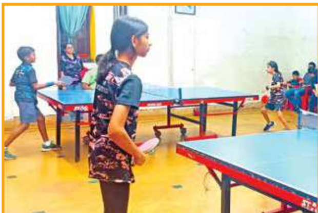
Table Tennis Home Tournament was held on 2nd & 3rd September 2023, with 50 enthusiastic participants. The matches were competitive and the finals were neck to neck.

The Procter YMC Branch, established in 1915, continued to provide decent and economical hostel facility with 60 beds for working men from different parts of the country working in Mumbai. The Branch also offers gymnasium, table tennis, badminton, spin biking and carrom. Mallakhamb, a new activity, was the most popular this year.